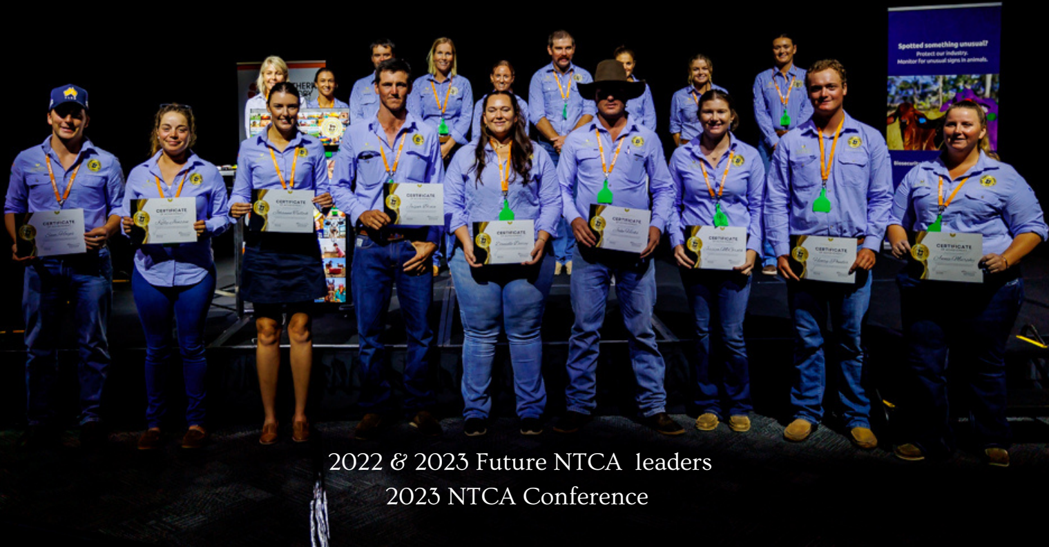
2022 & 2023 Future NTCA leaders 2023 NTCA Conference

The Georgina Pastoral Future NTCA program distinguishes up and coming leaders in the NT beef industry and enables them to reach their full potential through professional development workshops, industry tours, and networking events. Participants are equipped with the skills and knowledge to present themselves in a professional and clear manner, lead and mentor their peers, and inject new ideas and enthusiasm that influence the future direction of the NT pastoral industry.