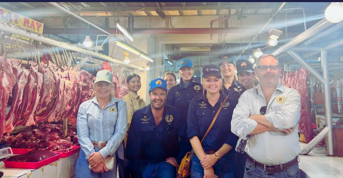
2023 Leaders at underground Jakarta wet markets, Indonesia

Now approaching its tenth year, the Georgina Pastoral Future NTCA program provides participants with the opportunity to network with current industry leaders, stakeholders and representatives from Territory and Federal Governments. Participation in the program will support the future leaders to establish relationships and the capacity to positively influence individual career aspirations as well as guaranteeing the continuing growth and prosperity of the pastoral industry.